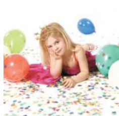
Find the perfect party place in New York City