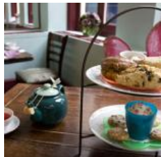
Alice's Tea Cup