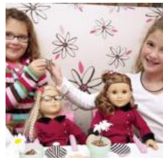
Afternoon tea for NYC kids